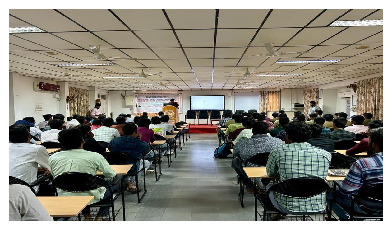
Students attended the ISHRAE Student Chapter Installation Ceremony and Guest Lecture