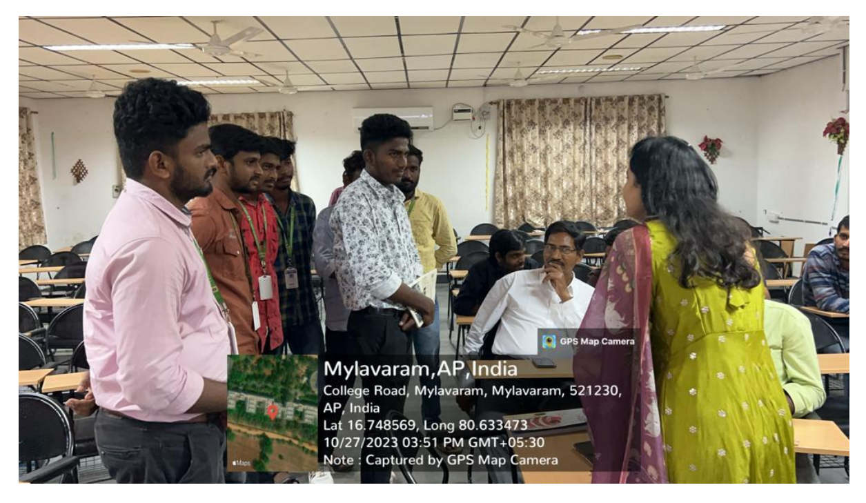
ISHRAE Experts interacting with the sudent aspirants to become Entreprenuers