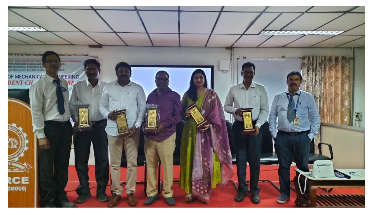
Felicitation and Memento presented to Team members of ISHRAE Vijayawada Chapter