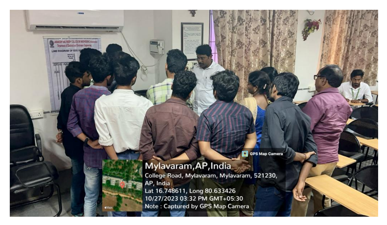
ISHRAE Expert explaining the function of window air conditioner to the students