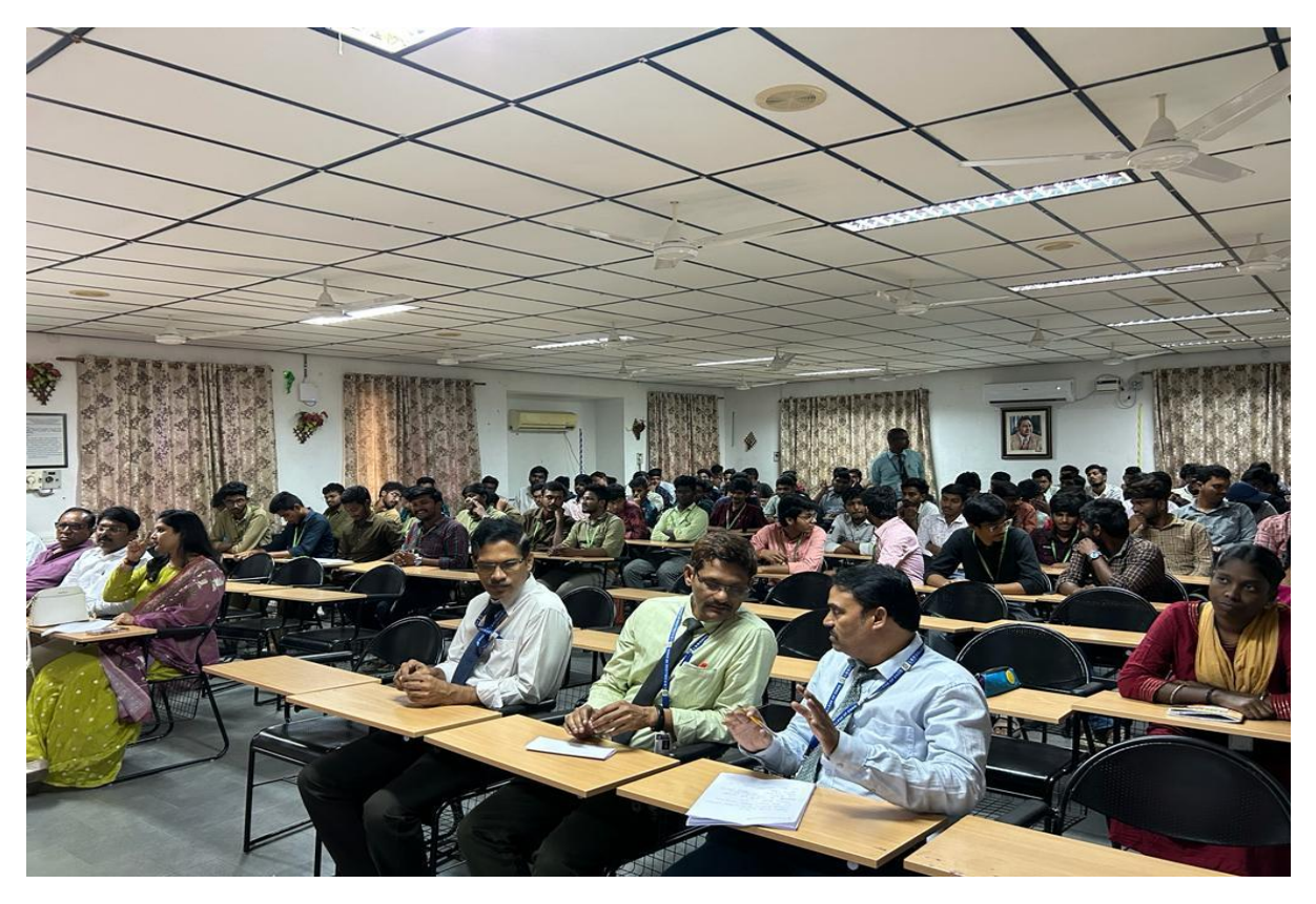
ISHRAE Team members, LBRCE Faculty and Student attendies in the Seminar Hall